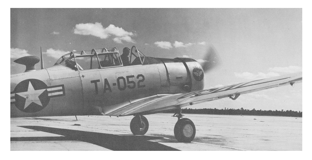
3303 Training Squadron (Contract Flying) student pilot on first solo sortie.