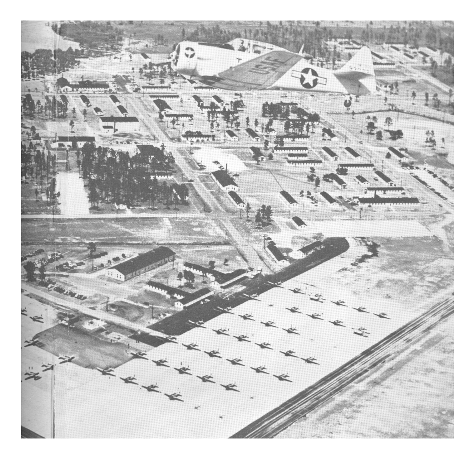
3303 Training Squadron (Contract Flying) T-6G over Bartow AB, FL, 1952.

USAF Unit Histories Created: 16 Jun 2011