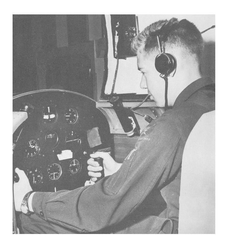
Student pilot flying "the Box' (flight simulator)."