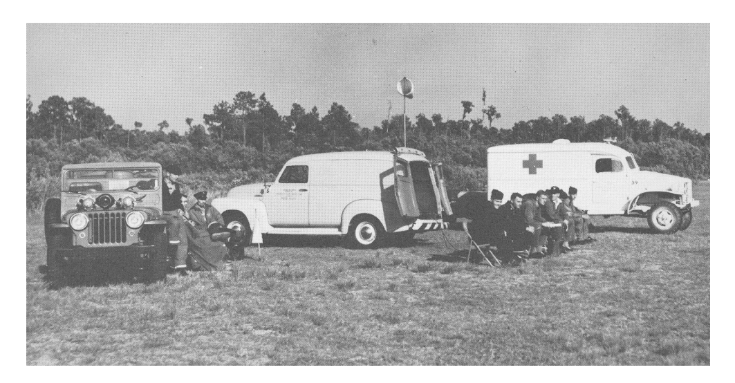
3303 Training Squadron (Contract Flying) instructors and crash crew standing by at end of Bartow AB Runway.